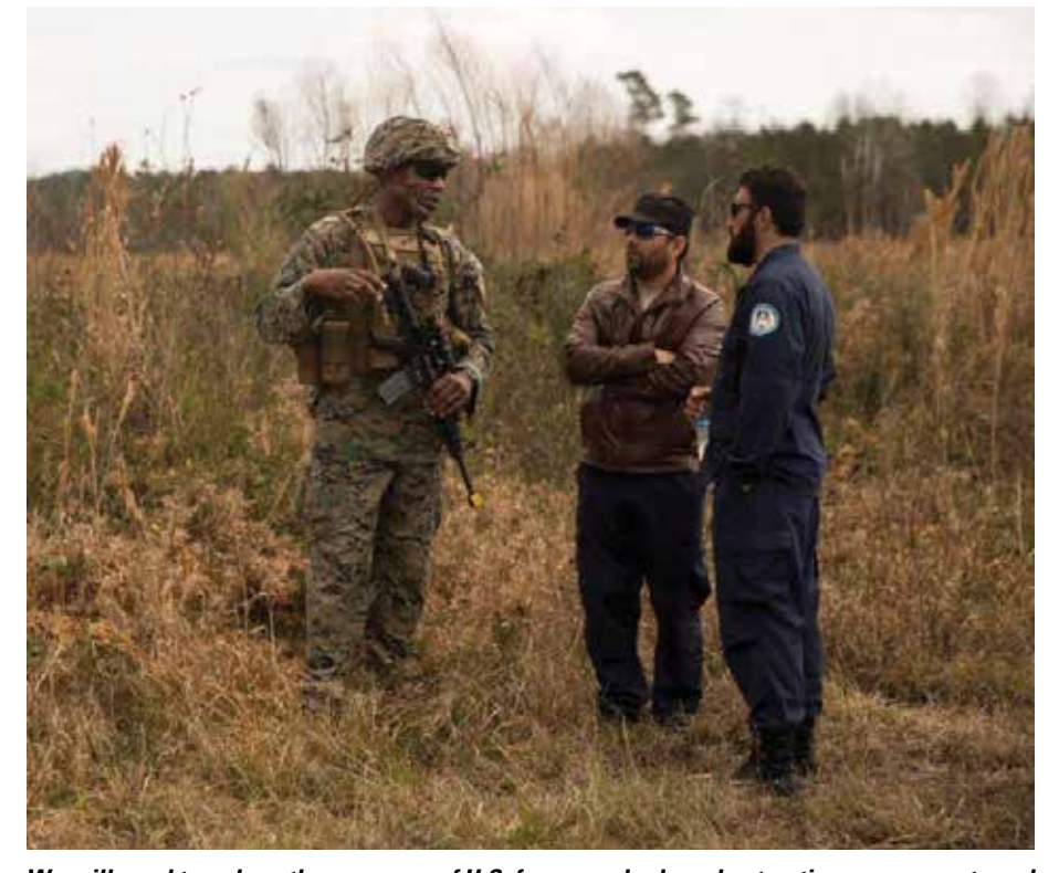
We will need to reduce the presence of U.S. forces and rely on host-nation governments and forces.

Here at home, disenchanted and culturally alienated Americans, especially young American Muslims, tire of being harassed, demonized, and told they don't belong here. They find common ground with young, angry black Americans and morph into an enemy within while interbreeding with Iranian-backed Latin drug cartels<sup>3</sup> to finance internal urban warfare. This scenario may be 3 to 10 years out, as-