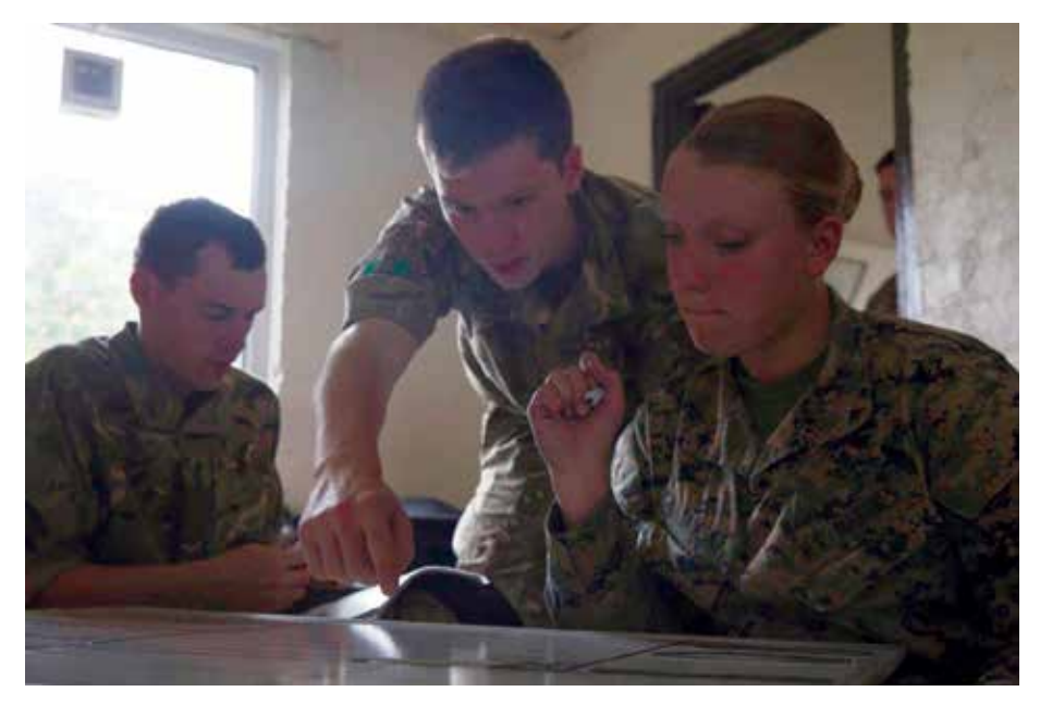
Successful operations against jihadists will require intelligence sharing between the U.S. and partner nations.

should we have preconceived ideas as to what is the right outcome in this world that is not ours; indeed many are fighting precisely because they don't want their world to be like ours.